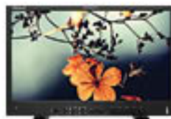
4K24bHDR See page 20