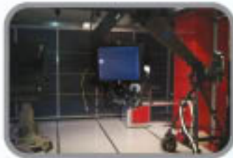
CNN Studios, D.C.

For two decades, Boland has manufactured dependable, high quality teleprompting models with built-in scan reverse, in 4:3 native aspect, in 8", 10", 12", 15", 17", and 19" sizes. DayBrite (1500 nits) or standard brightness...you make the call. Our monitors are used on-set at CNN, for television shows like The View, The Talk, American Idol, and the Bachelor, by multiple international heads-of- state, and by American Presidents.