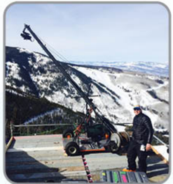
Mountain Coast Productions, Denver