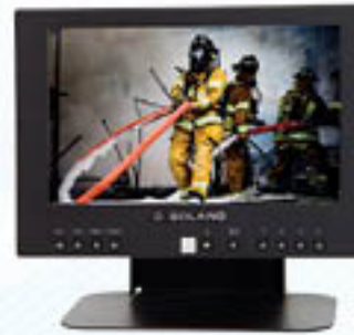
Desk Top Stands up to 65"