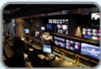
Sadie, Harb Productions, Knoxville

If you are building a truck, van or flypack, and need monitors for multi-viewing, shading, or as throw-downs, we would be proud to design some tough and dependable monitors for your specific needs. With the most responsive customer service in the industry, and custom models made to order, Boland will keep you rolling down that highway knowing that monitoring will never be a worry when you come to the next stop in the line.