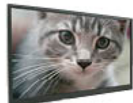
PVB32_TE See page 22