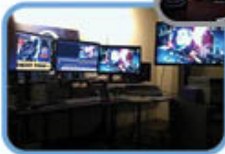
World Poker Tour, Los Angeles