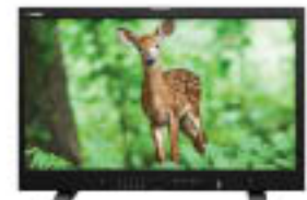
BHB24aHDR-DayBrite See page 19