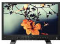
4K24bHDR See page 20