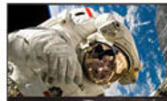
BHB55aHDR See page 24