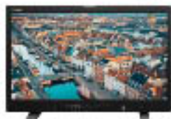
BHB16aHDR DayBrite See page 17