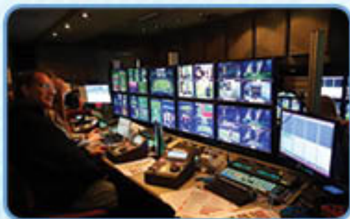
Sports Venue Control Room Operations