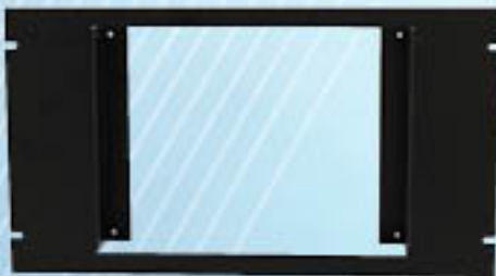
Rack Mount Plates and Frame