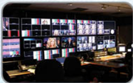
Late Night Talk Show Control Room