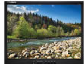
TP19 DayBrite See page 19