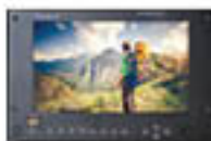
BVB07-HDR-DayBrite See page 16