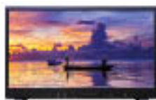
x4K31HDR5-OLED See page 21