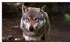
4K55bHDR See page 24