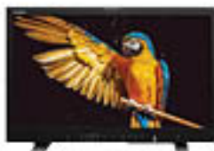
BHB17aHDR See page 18