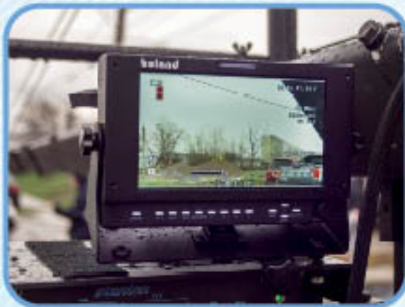
Exterior Episodic, New Orleans

Our DayBrites are available in a 4:3 aspect, in sizes 8", 10", 12", 15", 17" and 19". They are also available in a 16:9 aspect, in sizes 7", 9", 12", 16", 20", 24", and 32". And all come with just about any signal input and monitor feature you may need.