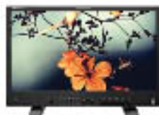
4K24HDR_TE See page 20