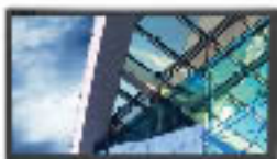
PVB20_TE See page 19