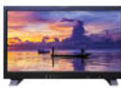
x4K31HDR5-OLED See page 21