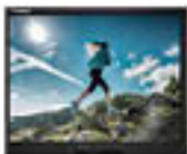
TP10 DayBrite See page 17