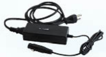
Power Supplies (various sizes)