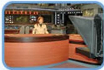
MBC News Studios, Korea