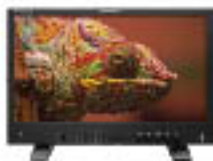
x4K22HDR-OLED See page 19