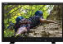
BHB24aHDR See page 20