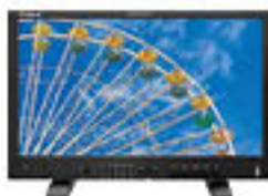
x4K27HDR5-OLED See page 21