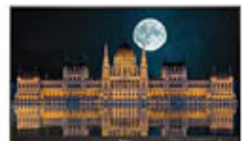
4K98-HDR See page 25