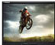
TP12 DayBrite See page 17