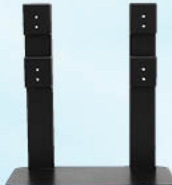
Stationary Stand Under 55"