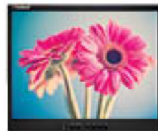
TP15 DayBrite See page 17