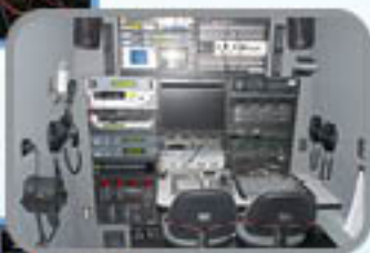
L3 Communications, Santa Rosa