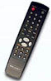
IR Remote Control