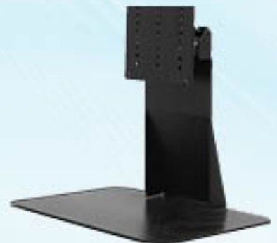
Tilting Stand Under 20"