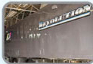
Revolution, All Mobile Video, Bogota