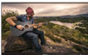
BHB42aHDR See page 22