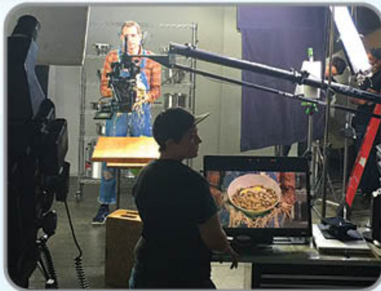
Digital Film Studios, Burbank