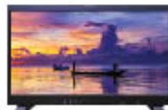
x4K31HDR5-OLED See page 21