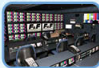
GTX-17, F&F Productions, Clearwater