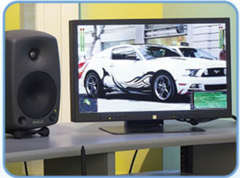
Team Detroit, Detroit

Color is Critical! These words, more than any other, describe the Boland models suggested for Post Production. Lots of colorists use lots of different sized monitors. They work in diverse color space, on various types of projects, for different entertainment mediums. Their work is varied. It is unique depending on scope. But there is one criteria important to all: Accurate Color.