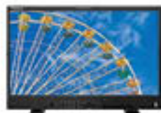
x4K27HDR5-OLED See page 21