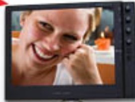
6" Panavise 1/4-20 Mount