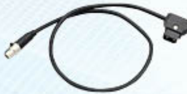
P-Tap to Mini XLR Power Cable