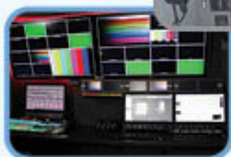
Fly Pack Rental Unit, Glendale