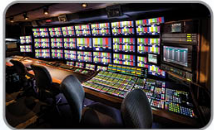
Double Eagle, NEP, Pittsburgh

Mobile broadcast is tough. There is no rest for the weary, and often times trucks and vans get no rest at all (and neither does the crew for that matter). Being on the road 24/7/365, a mobile broadcaster demands equipment that can endure thousands and thousands of miles. With respect to monitors, Boland is proud to build models for the best of the best.