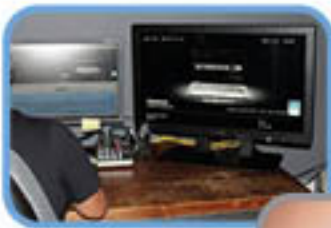
Zolo Studios, Culver City