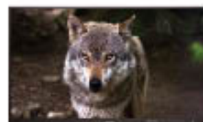
4K55bHDR See page 24