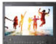
BVB09-HDR-DayBrite See page 16