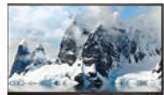
4K65bHDR See page 25