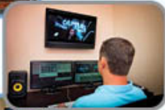
NewTek Post Facility, San Antonio