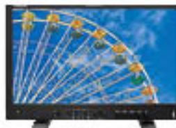
x4K27HDR5-OLED See page 21