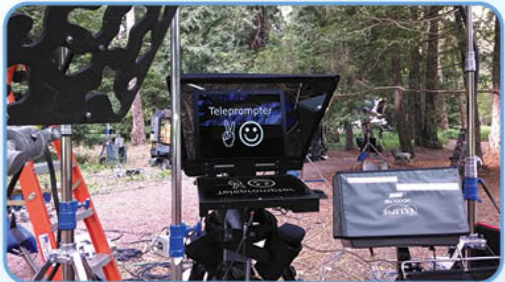
DayBrite Teleprompter On Location

Available Models: TP8DB, TP10DB, TP12DB, TP15DB, TP17DB, TP19DB