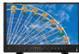
x4K27HDR5-OLED See page 21