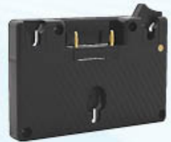
Anton Bauer Plate (V Mount also available)