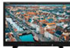
BHB16aHDR-DayBrite See page 17