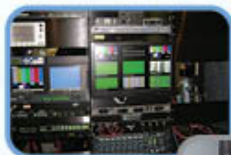
E.N.G. Field Van

Check out our BHB and PVB Series in 17", 24", and 32". All offer 1920x1080 resolution with 2K support, 16 channel audio, and are pre-calibrated at the factory. Or for the discerning eye (and D.I.T cart), perhaps you would be interested in the new 4K31-HDR! With 1000nts and High Dynamic Range... who could ask for more.