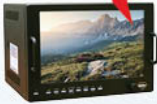
B6M4K Signal Generator